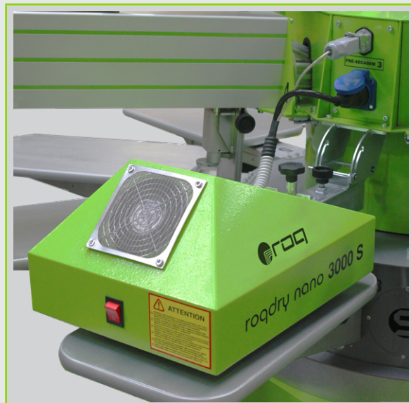
:: NANO FLASH CURE UNIT EMBEDDED IN THE STRUCTURE

30 Years of knowledge, experience and engineering condensed into a powerful platform for small prints . The NANO can be moved without the need to level the machine increasing its versatility .