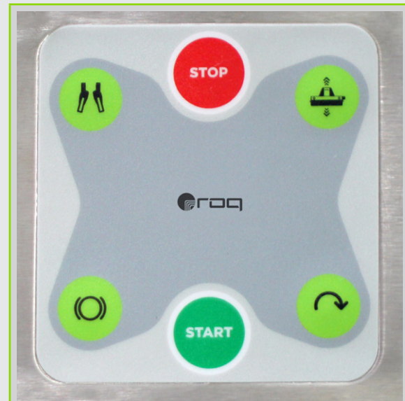
:: COMMAND PANEL IN EACH PRINTING HEAD